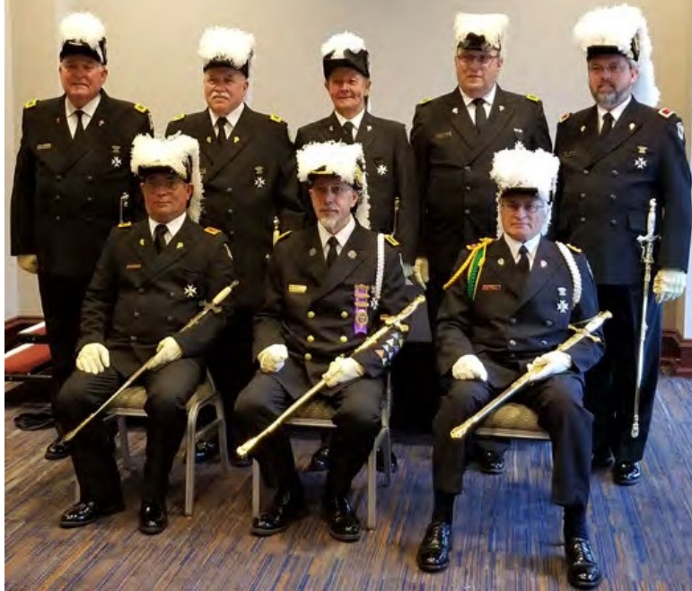
(Virginia Team that competed at the 2018 GEKT Triennial)

Regardless of the size of the Drill Team, the competition allows for 2 “Supernumerary Knights.” These are extra members of the Drill Team that can take the place of a marching Sir Knight in the event that they are not able to march, for whatever reason. The Supernumerary Knights are required to stand for Personal Inspection, but not to march unless called upon to do so and, they are not included in the Drill Team score, unless they march.