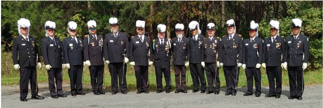
(Attendees of the 2021 Grand Commandery Drill School and Competition.)

“I challenge you and hope to see you all on the Drill Field!”