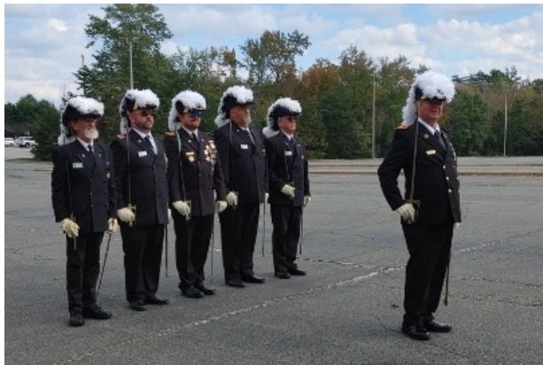
New River Valley Commandery #32 is pictured on the left and is the first Drill Team to be offered the honor of performing a Grand Commandery Drill Exhibition.

On occasion one or more Drill Teams may be honored and provided an opportunity to put on a Drill Exhibition for the Grand Commandery. This is a public display or demonstration of a Drill Team’s skill and precision. It is an honor for the Drill Team as well as an unexpected pleasure for any spectators.