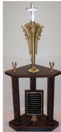
(2020 Drill Competition Champions and Trophy)