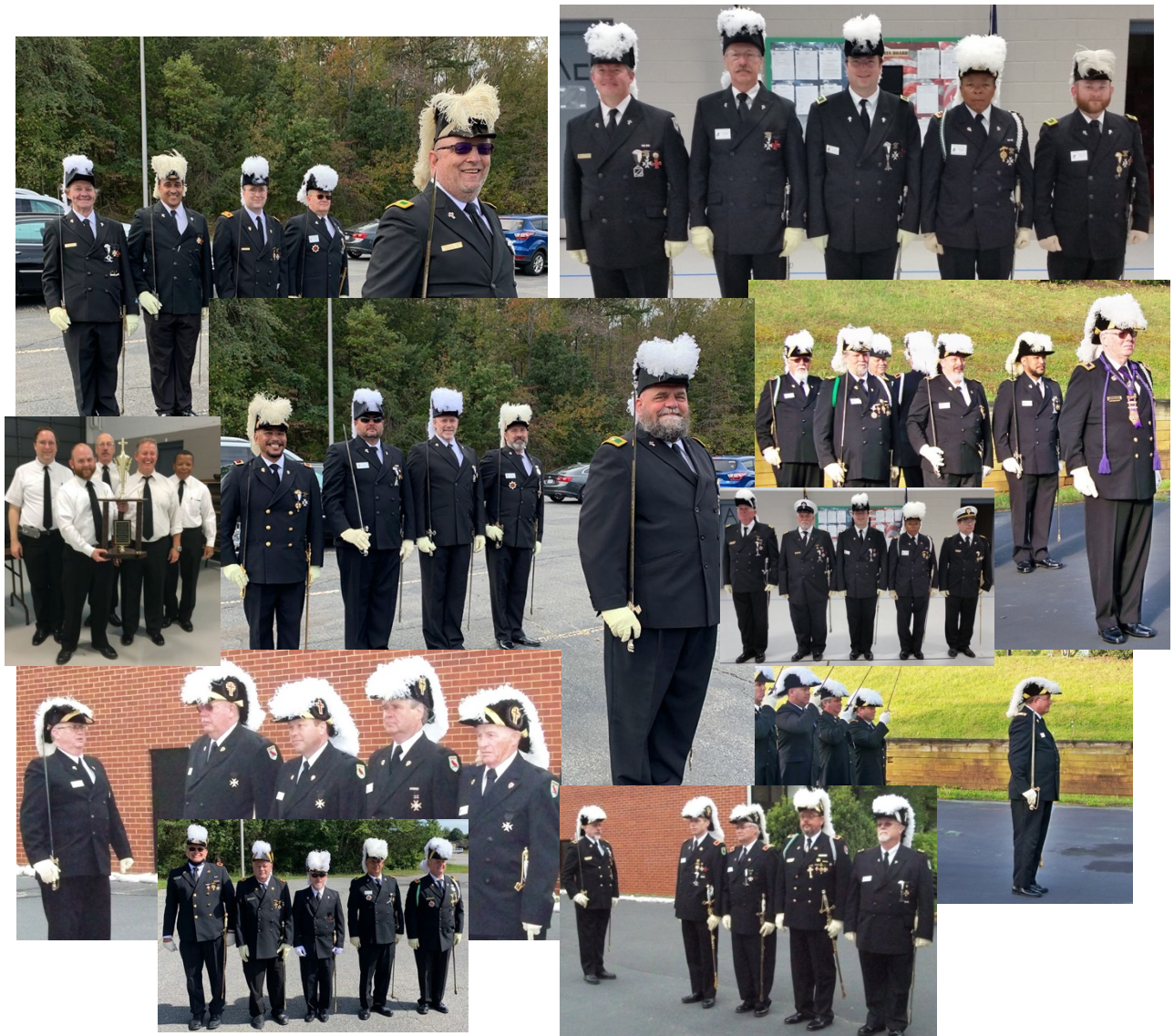
(Photos covering years of camaraderie and fun at Grand Commandery Drill Competitions)

Anytime we perform these drill skills in public we are also, in fact, actively recruiting for our membership. Competitive drill also builds cohesiveness. A team comes together, practices, and then performs as a unit. There are opportunities to meet other Fraters who are doing the same. This is one of the best benefits, drill activities build camaraderie and esprit de corps within the fraternity, thus encouraging membership retention.