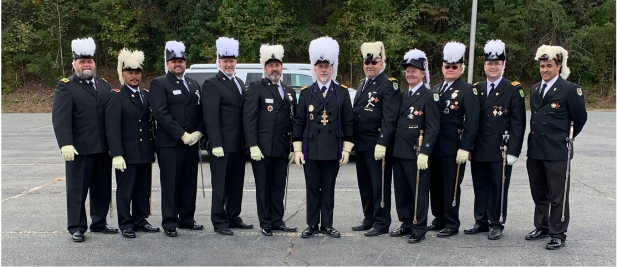
(Attendees of the first Drill School)

Currently, at least once per year, the Grand Commandery holds a Drill School immediately followed by a Virginia Class ‘E’ Drill Team competition. The Drill School goes over the sword manual and every sequence of commands in the Drill Routine prior to the competition. All of these can be found in the “ DRILL REGULATIONS of the Grand Encampment of Knights Templar of the United States of America. ” (I recommend every Commandery have one.)