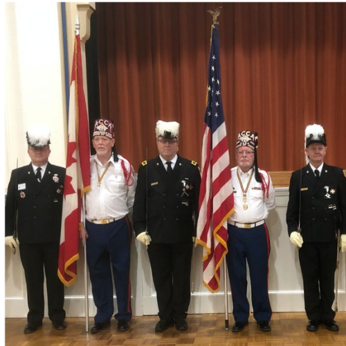
(Sir Knights participating in the presentation of colors)

There are other drill related activities that have many of the same benefits as competitive drill and, as such, are also highly encouraged. These typically fall within the 'exhibition' category, meaning they are a non-competitive display of Knights Templary that may or may not include precision tactics. Though not an all-inclusive list, some examples of this are marching as a unit in parades, performing flag ceremonies, and presenting the colors at public or private events.